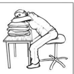
Adapted forward lean for sitting