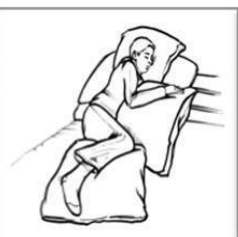
Adapted forward lean for lying