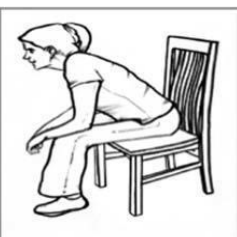
Forward lean 2