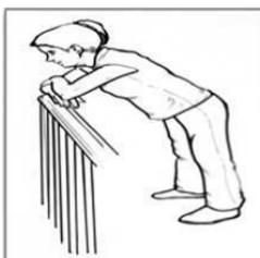
Forward lean 1